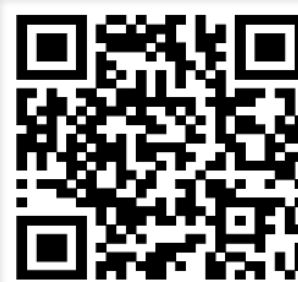
Aubry Bend Middle School PTO

The event this Saturday is sold out!!! But, that doesn't mean you get shop the auction! You don't have to be present to win. Check it out at Blue Valley Educational Foundation - Battle of